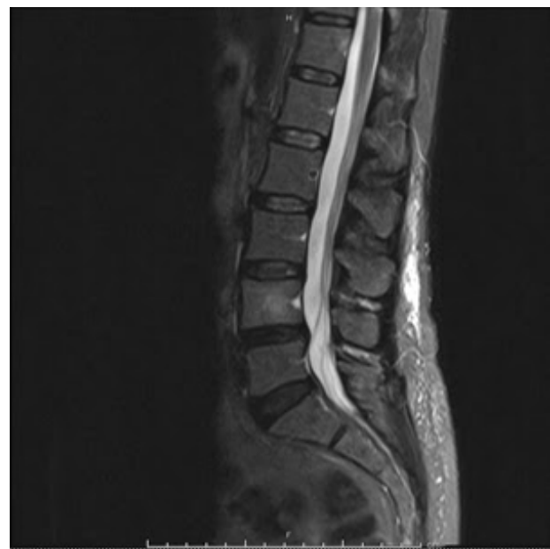
Figure 2. MRI of lumbar and sacral spine without pathologic fractures or spinal cord compression.